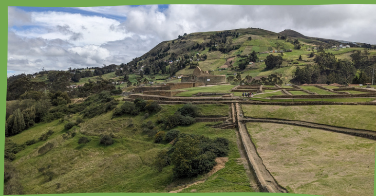
Ingapirca ruins, Ecuador. Participant's photos.