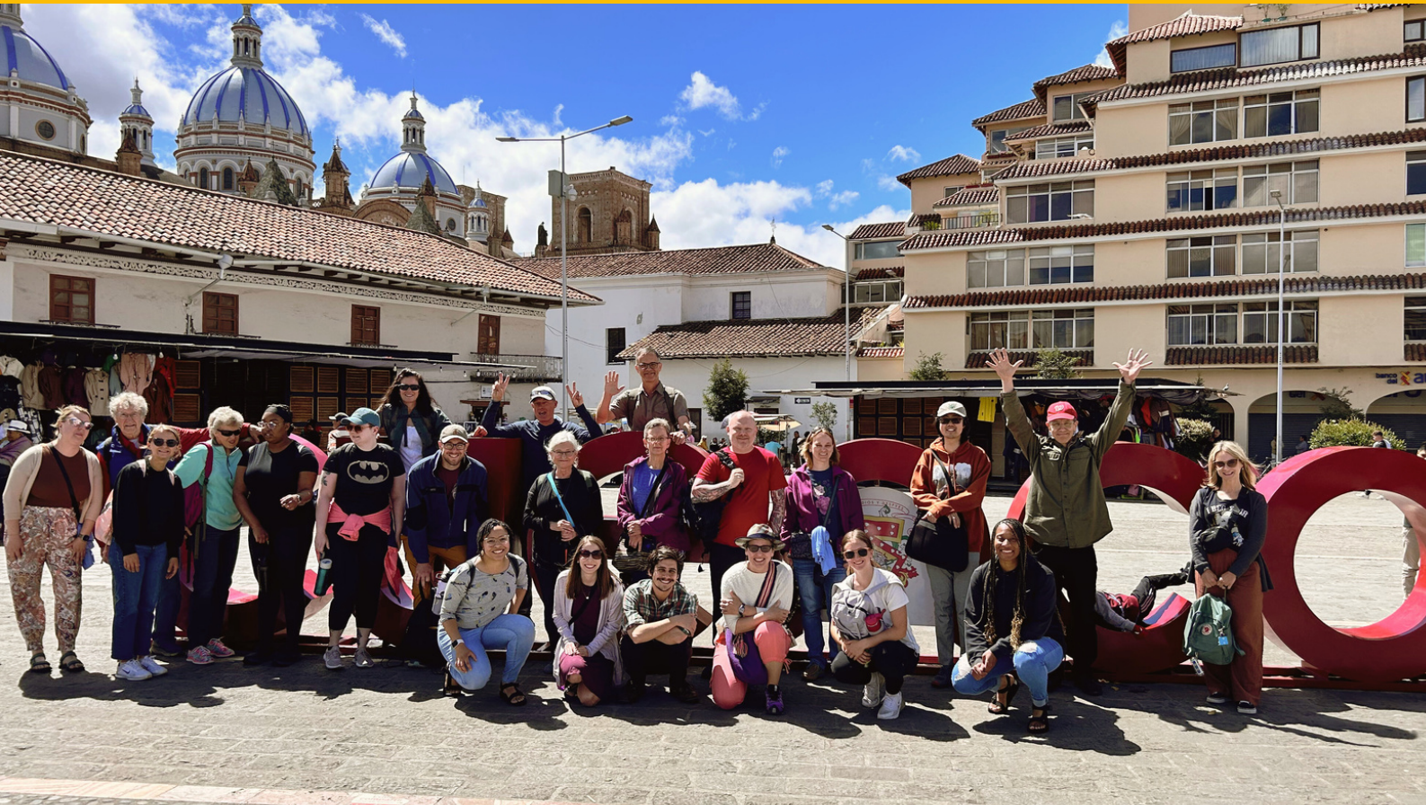
*Immersion participants in Cuenca, Ecuador