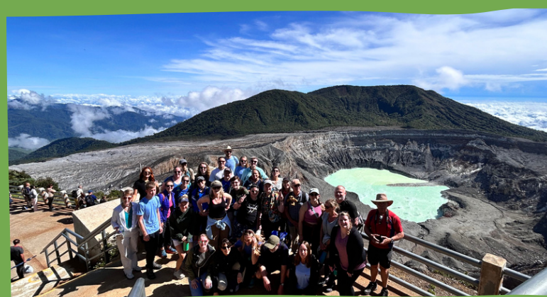
Participants at Poás Volcano, Costa Rica