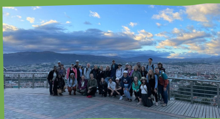
Participants in Turín, Cuenca, Ecuador