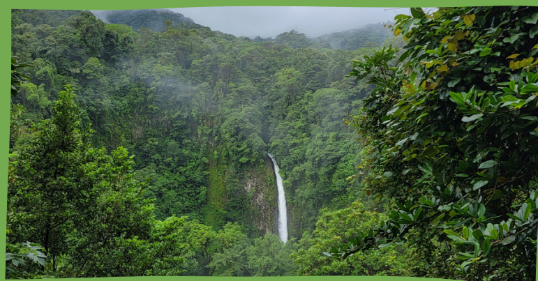
La Fortuna, Costa Rica.